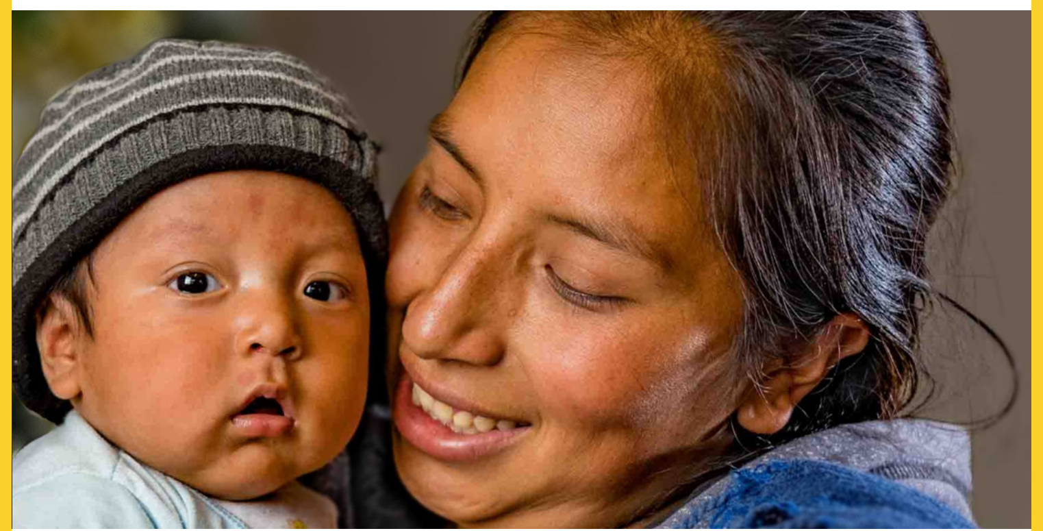
New beneficiaries bring new opportunity for positive impact.

The planet cannot carry more waste and CSK beneficiaries cannot afford to buy diapers and feminine hygiene products. There are innovative solutions and CSK is investing in them.